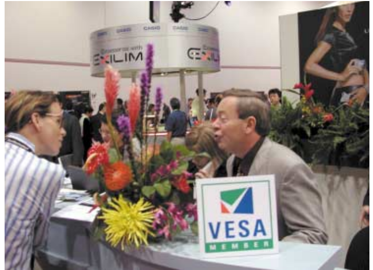
More than 20 VESA Member Company signs were displayed throughout CES by exhibiting VESA member companies.

Peerless Industries, a maker of commercial mounts and accessories used the VESA logo and member company logo in all of their booth graphics and marketing materials. Most companies were enthused to see VESA represented at the show. For CES 2005, which organizers expect to be even bigger, the VESA Marketing Committee will consider sponsoring a small booth.