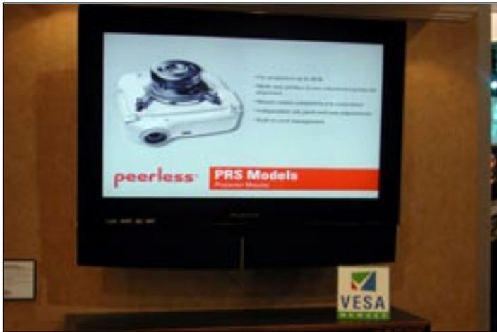
33 member companies proudly displayed the VESA Member Company sign in their booths. Peerless Industries, a leading flat panel and projector mount manufacturer displays the VESA Member Company sign directly under the display of their newest pull out swivel SmartMount™ SP850.