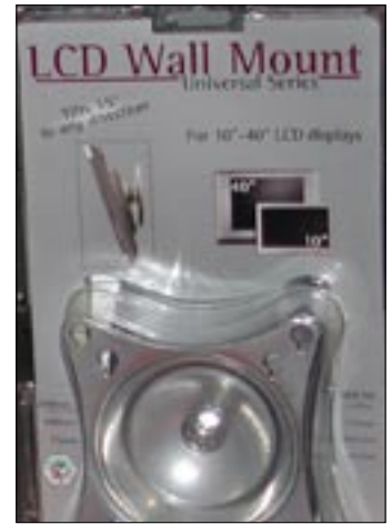
Mount companies AVF and Premier both released new retail packaging at CES that featured the VESA Mounting Compliance logo.

top buyers in attendance to the top-notch keynotes and conferences, government leaders, entertainment superstars and exhibitors, the 2006 International CES shifted from simply a tradeshow to a major global event.”